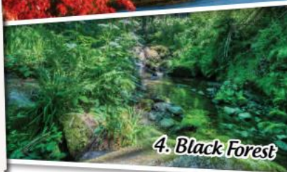
4. Black Forest