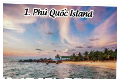
1. Phú Quốc Island

These places are the best for people who like: doing sports/taking photos.