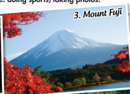
3. Mount Fuji